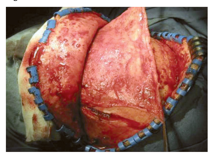
Figure 2. Bicoronal incision with visible periosteum flap.